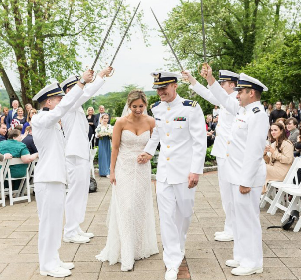
Left to Right, Clockwise: Addie Eshelman Photography, Tara & Renata Photography,