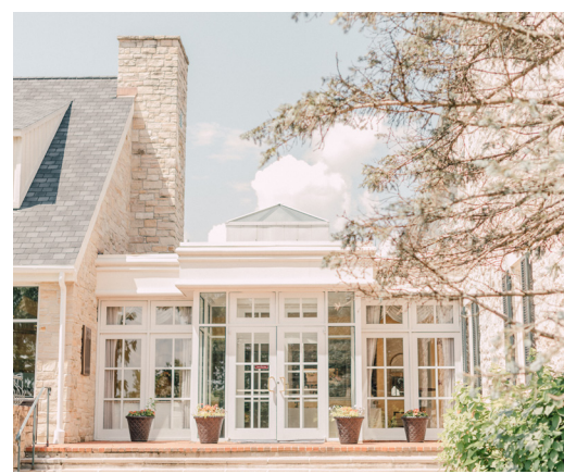
Left to Right, Clockwise: Addie Eshelman Photography